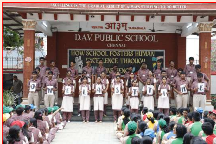
One Last Time – Show down by XII C