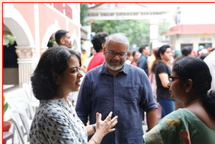
Parent's Interaction with the Principal about School initiatives