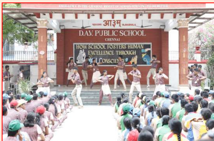
Kinesthetic Movements revealing the joy of Choosing good Conscience