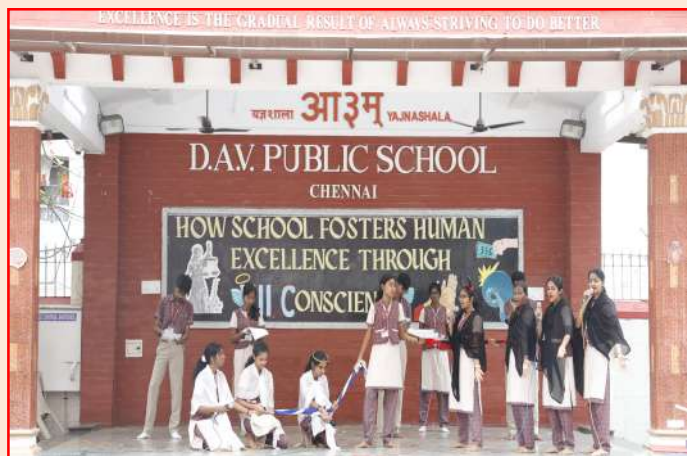
Thematic Musical Melody