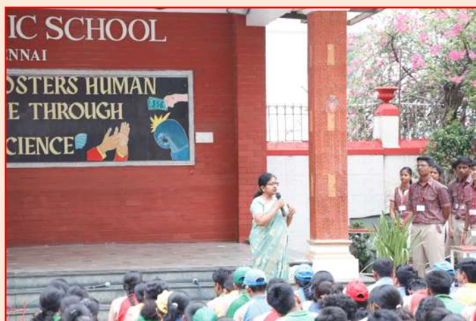
Principal's words of Appreciation